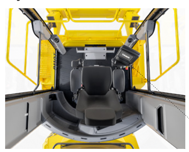
Spaceous cabin with excellent visibility for operational safety & efficiency.